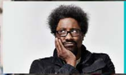
CNN's United Shades of America