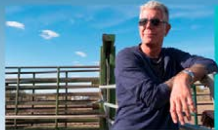
Anthony Bourdain Parts Unknown