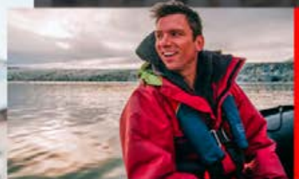
Bill Weir The Wonder List