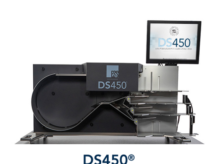
High-Throughput Scanner & Tabulator