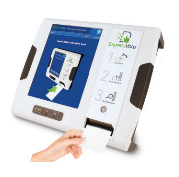
ExpressVote ® Universal Voting System