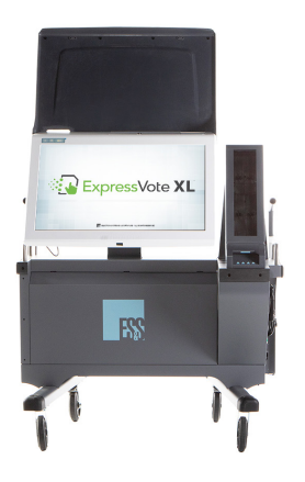
ExpressVote XL <sup>™</sup> Full-Face Universal Voting System