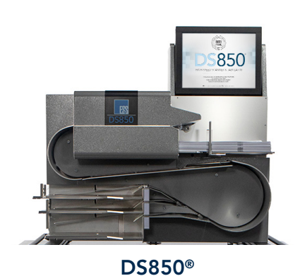
High-Speed Scanner & Tabulator