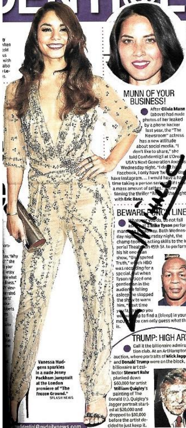
Vanessa Hudgens sparkles in a nude Jenny Packham jumpsuit at the London premiere of "The Frozen Ground."